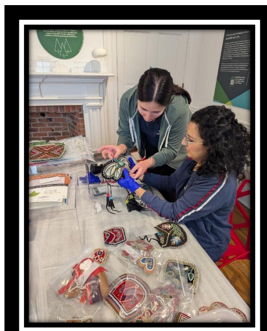
Museum staff installing Spirit Seeds