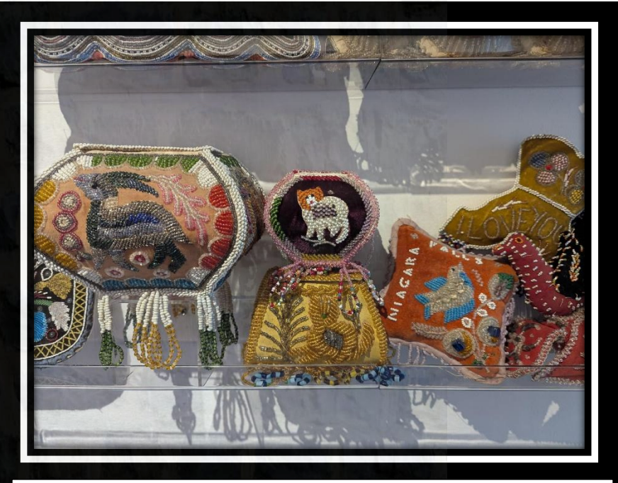
One of the stunning beadworks on display