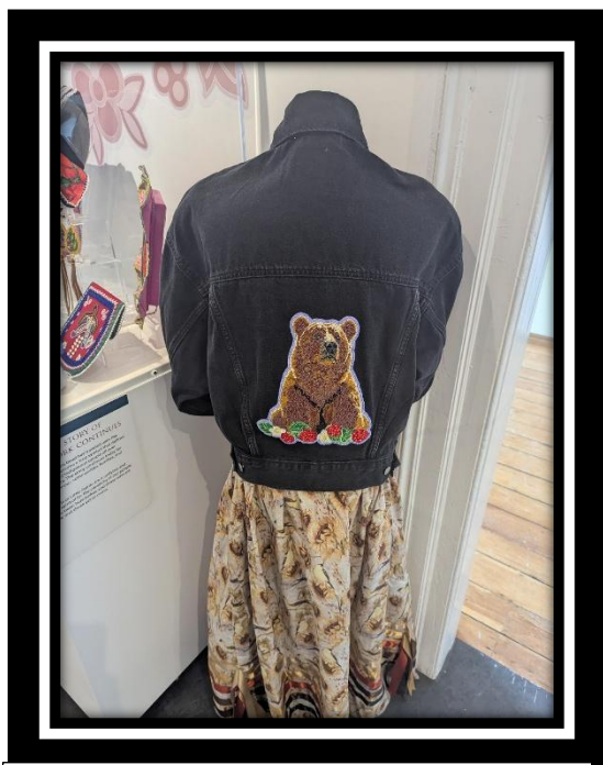
One of the stunning beadworks on display