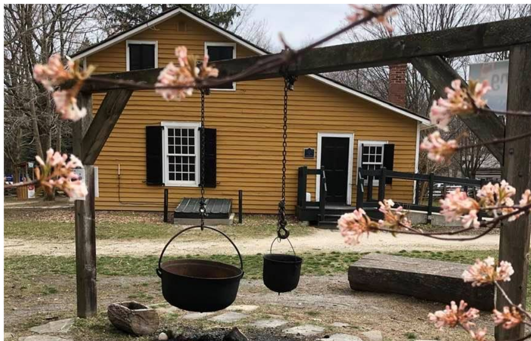
Bradley &amp; cauldrons: