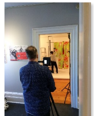
Behind the scenes of collections photography, 2020