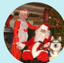
Photos with Santa & Mrs Claus in the Log Cabin - Bradley Museum December 2017