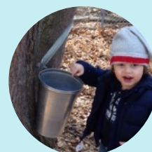
Maple Magic March 2018