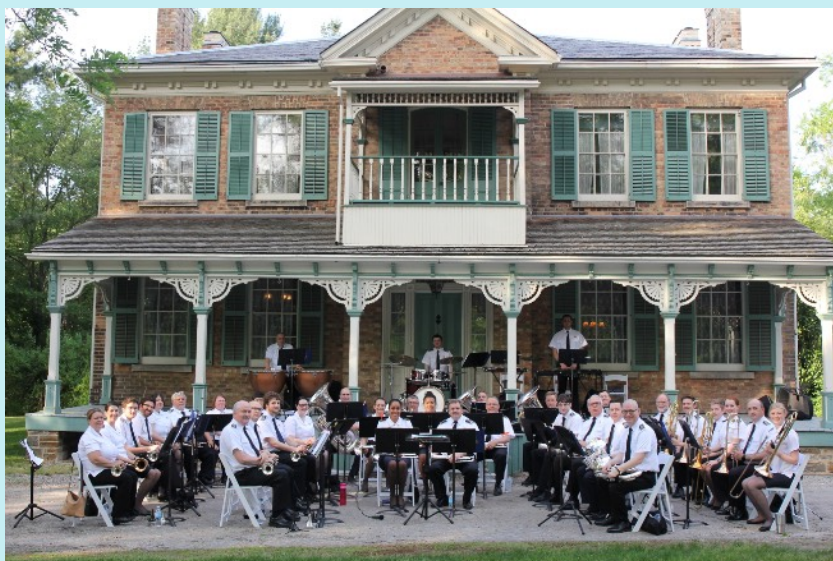
The Mississauga Temple Band