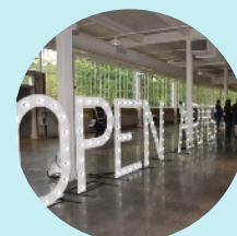
Opening of Small Arms Inspection Building June 23, 2018