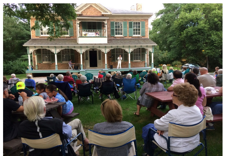
“ELVIS” wows the crowd