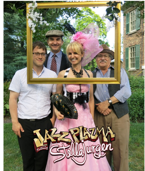
Jazz Plazma made music

Some 80 participants played lawn games, sampled wines and beer, and while everyone was mingling, hostesses served delicious finger food and desserts catered by Michael's Back Door. Guests were encouraged to tour Benares Historic House, view the Art Show and bid at the Silent Auction.