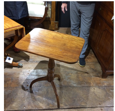
Tables and Mirror among items purchased for Bradley Museum