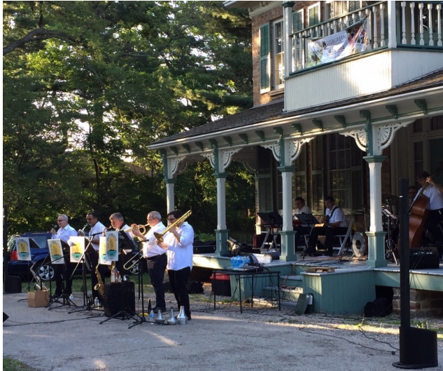
OCTOKATS share some fine Jazz

From the beginning of June to the end of August we hosted “ ON THE VERANDAH ” at BENARES HISTORIC HOUSE . Local musicians and vocalists entertained us from the verandah. Guests brought their lawn chairs and we sold snacks and drinks. In July and August, Many Feathers Market added to the festivities with their food stalls, fresh produce and beer garden. Each Friday evening we were well entertained by Jazz, Swing, Choral, and Country music and even an evening with Elvis to celebrate the 40th anniversary of the death of “The King”. The money raised from our collection baskets is shared equally between performers and FRIENDS. Our portions is used to fund transportation for Peel schools who are able to bring their classes to the site for the Museum’s great educational programmes. With continued sponsorship from CRH, Samuel Son & Co. and Evergreen Retirement homes, we raised over $8000.00 for our bussing programme. Last year we funded 40 busses.