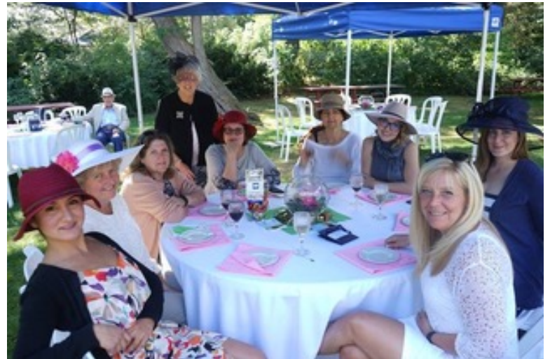
Guests enjoy the friendship, sunshine, food, wine and entertainment