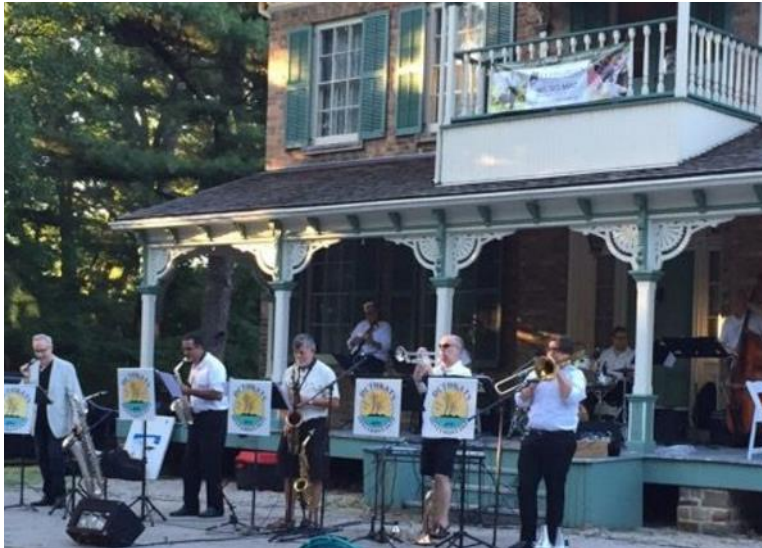
The OCTOKATS performed on July 15.

Organized by Friends of the Museums of Mississauga, the 2016 season of On the Verandah concerts at beautiful Benares Historic House attracted our best audiences since they began in 2005. During the summer months, we welcomed old friends who have faithfully supported us for years, and some talented new performers who, we hope will now become "old" friends.