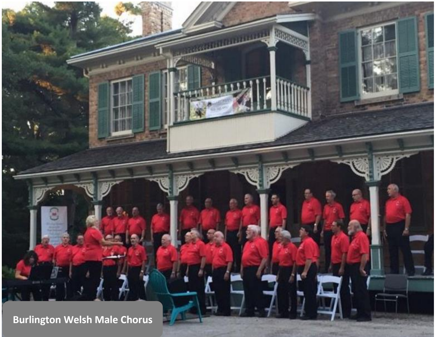
Burlington Welsh Male Chorus

The August 19 concert featured South Asian Performing Arts. Irfan Malik has lots of photos posted at: https://www.facebook.com/media/set/?set=a.964960780281487.1073742110.100003027229266&type=1&l=241fe9e784