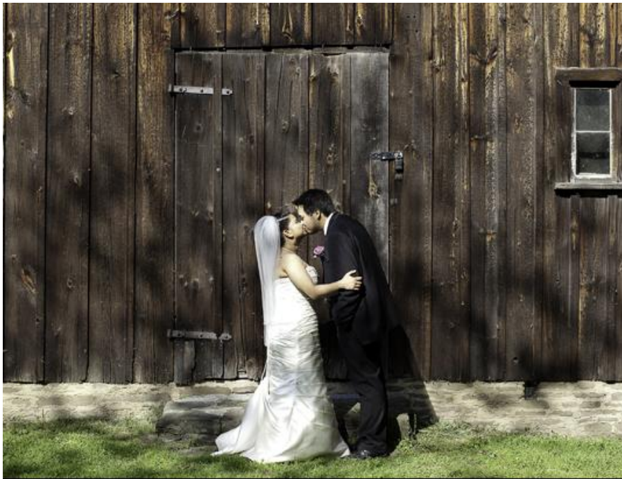
Here's a newly-married couple posed at Benares barn.

Benares Historic House, located at 1507 Clarkson Rd. N., is perfect if you want to infuse your photos with a rustic, Deep South element. This classic historical property that's been around for over 160 years offers both classic architecture (check out that old school veranda) and pristine gardens. This space is perfect for a Gone with the Wind -themed wedding, as both the house and gardens feel like they belong way south of the border. You'll be staying local without feeling like you're just down the road from your childhood home. You can also take pictures inside the house, if you want to create a more intimate vibe. If you're a big fan of the Louisiana bayou aesthetic or grand southern-style homes in general, this is the perfect spot for you.