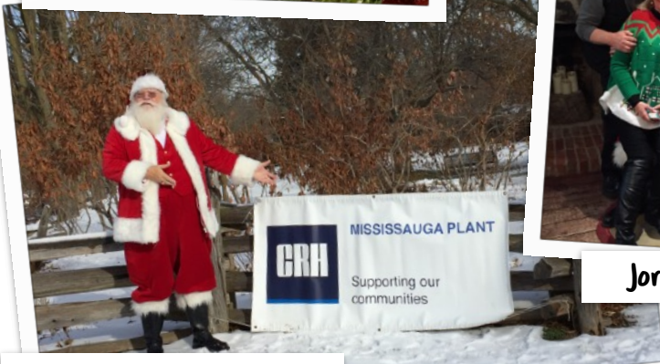
Thank you CRH

Sunday December 8th approximately 50 families arrived for their photos with Santa. Many families return year after year!