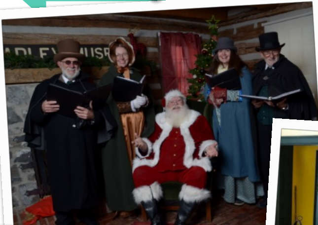
The Baker Street Victorian Carollers