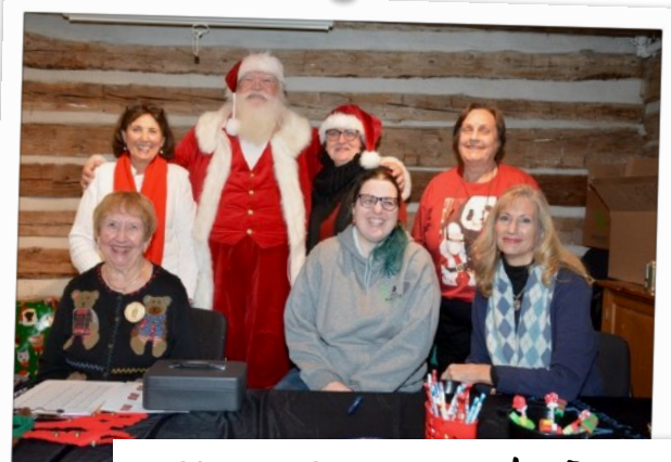
FOMM Family Photo Day

At this annual event, visitors experienced past Christmas traditions of early settlers in the 1800s. They enjoyed the many ways communities in Mississauga celebrated holidays at this time of year. There were carollers, creative crafts such as ornament making and storytelling. Staff prepared a traditional Christmas meal over the open hearth and made old fashioned gingerbread to sample. The turnout this year for this event was absolutely